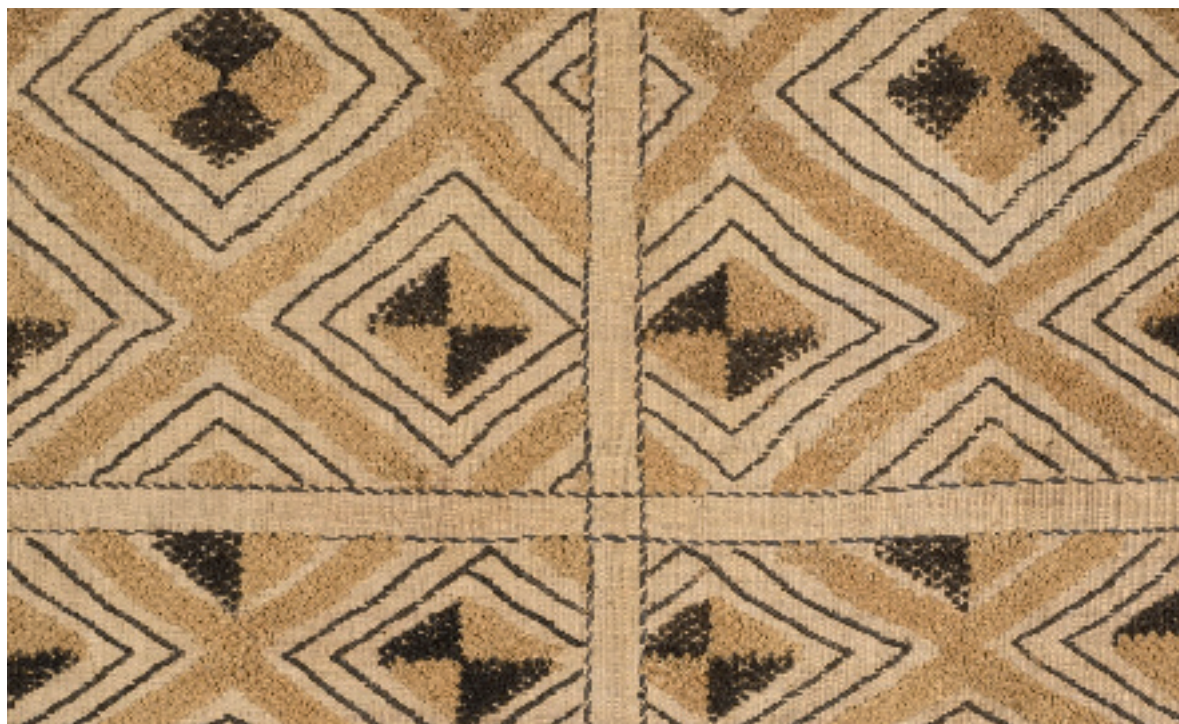
Kuba textile. EO.1980.2.2779

The Kuba textiles serve as the starting point for exploring four central themes: the production methods of raffia textiles, the social and royal meanings of patterns, the ways in which museums document and present these objects, and the contemporary continuation of this craft in a globalised context.