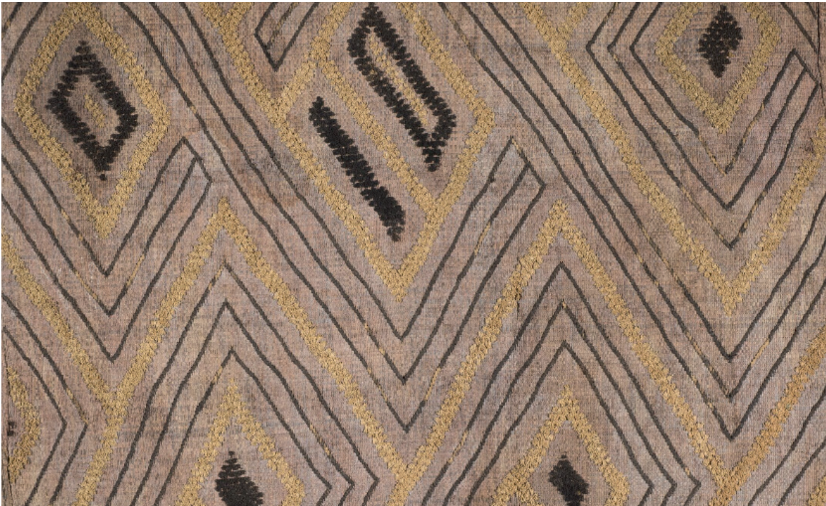
Kuba textile. EO.1980.2.2787