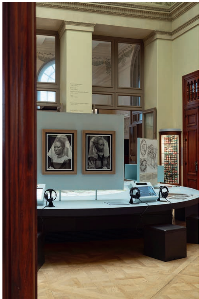
View on the AFROPEA space @ MRAC - KMMMA